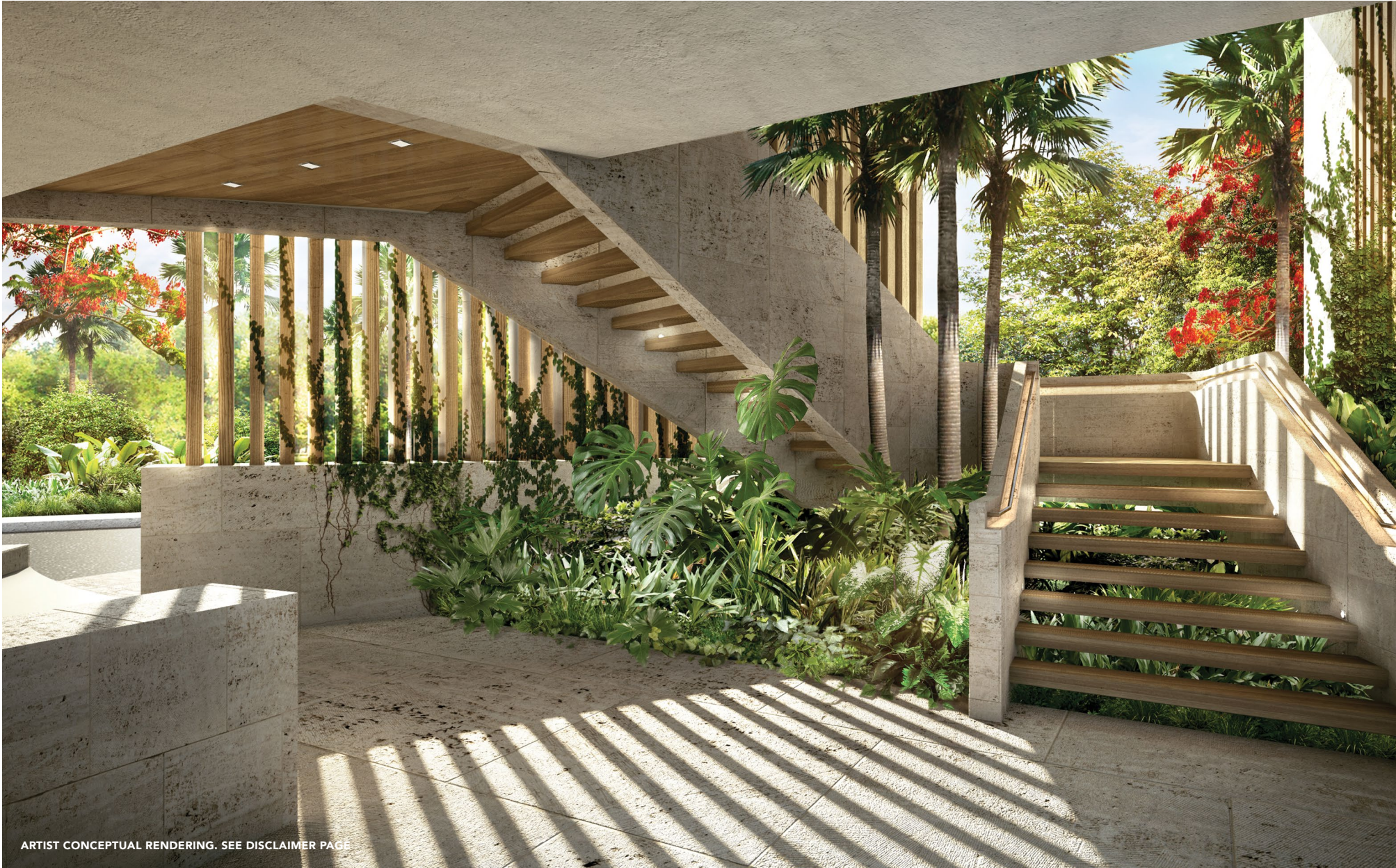
ARTIST CONCEPTUAL RENDERING. SEE DISCLAIMER PAGE

DEVELOPER: Grove Bay Properties, LLC ARCHITECT: Max Strang | Strang Architecture DESIGNER: Rafael De Cárdenas / Architecture at Large NUMBER OF RESIDENCES: Twenty Six NUMBER OF STORIES: Five RESIDENCE MIX: Two to Four Bedroom Residences from 1714 sq ft to over 4114 sq ft