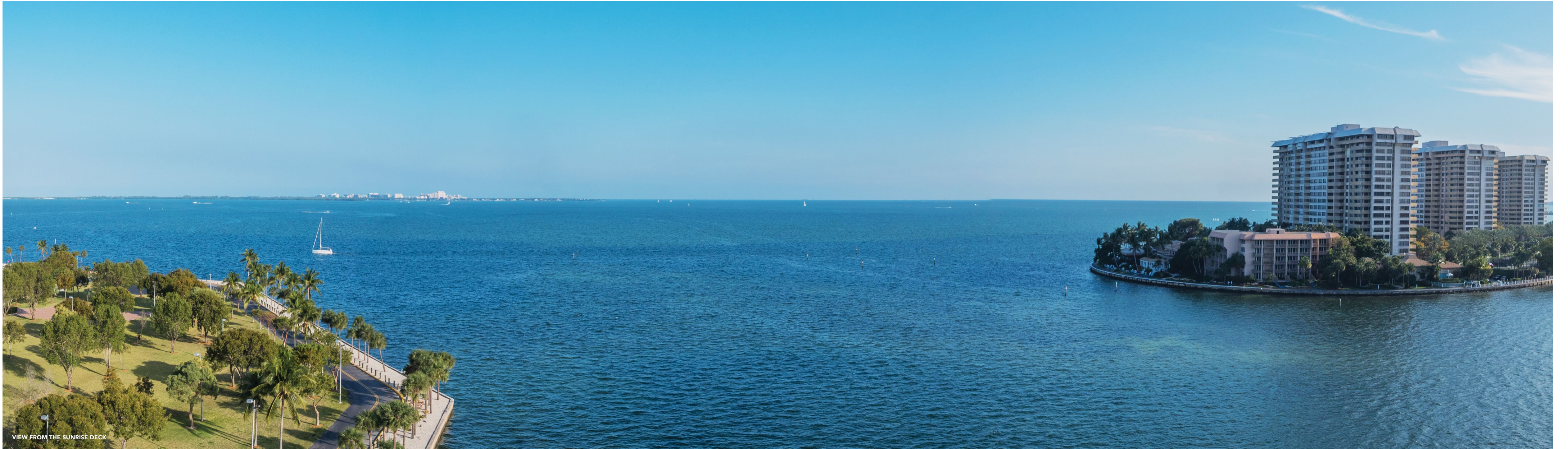
VIEW FROM THE SUNRISE DECK