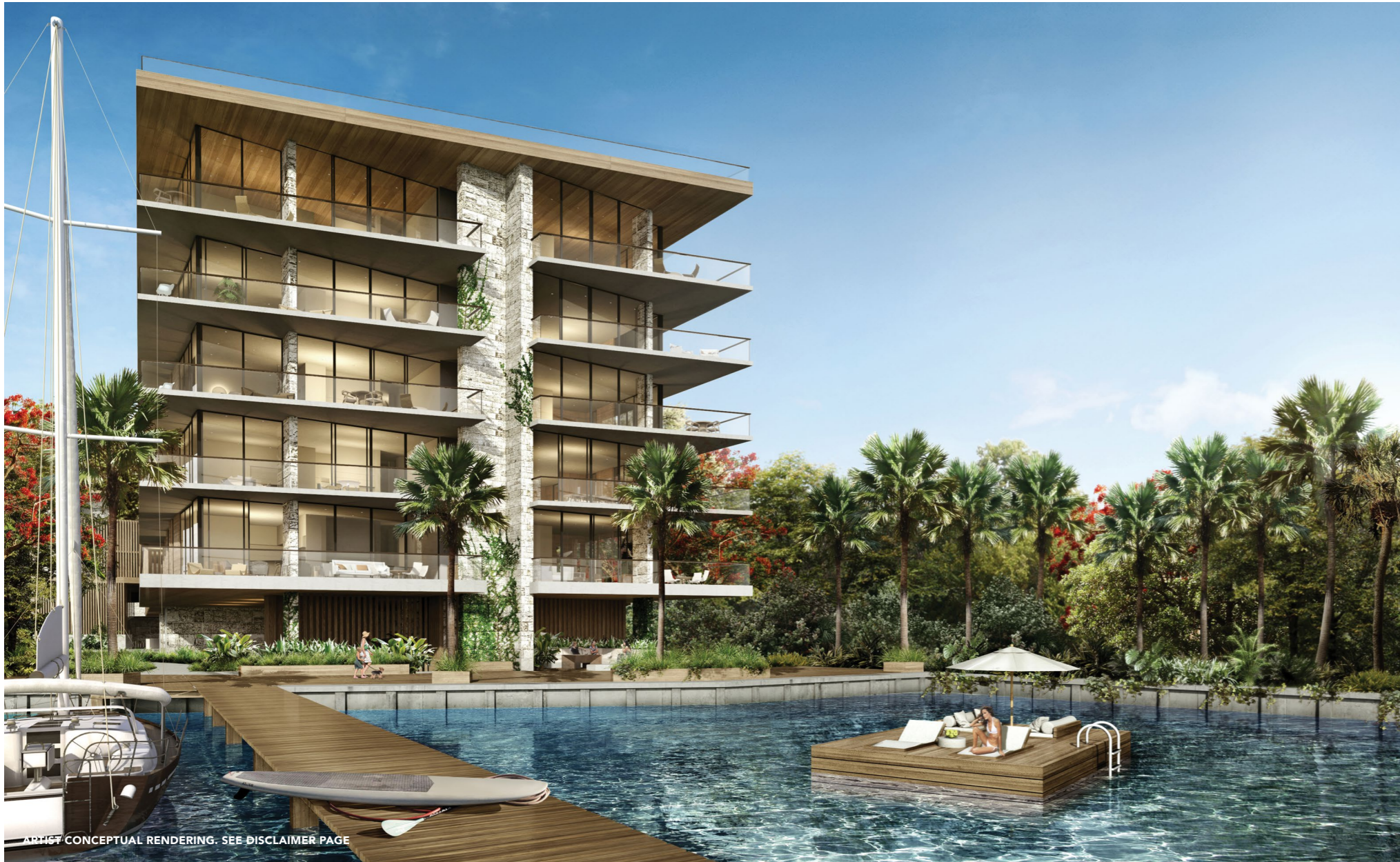
ARTIST CONCEPTUAL RENDERING. SEE DISCLAIMER PAGE